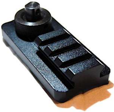
Sling Stud Picatinny rail adapter for rifle: Great for Atlas style QD Bipods.