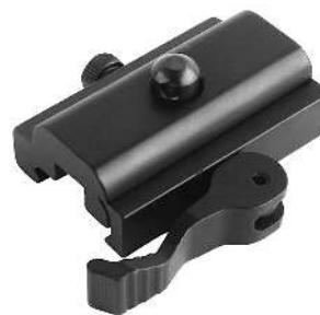
QD Bipod Sling & Harris Bipod Adapter for Picatinny Weaver Rails.