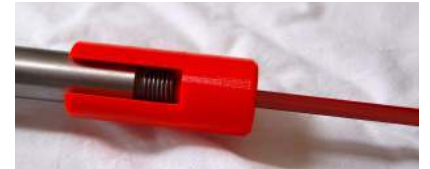
Ruger 10/22 Barrel Bore guide: built in muzzle guard - clean your barrel safely.

Protect the muzzle area and crown of your 17-22LR rifle. (rifle and cleaning rod not included)