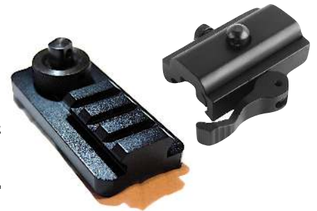
Swivel Stud Picatinny rail adapter for rifle & QR Harris style bipod adapter kit.