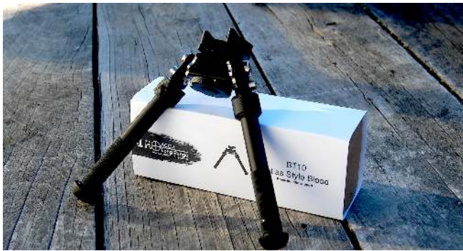
Atlas Style QD Bipods: As a kit with our Sling Stud Picatinny rail adapter or sold separately.