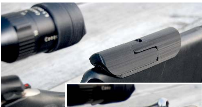
Front removes to help you remove your bolt

Protect the muzzle area and crown of your 17-22LR rifle. (rifle and cleaning rod not included)