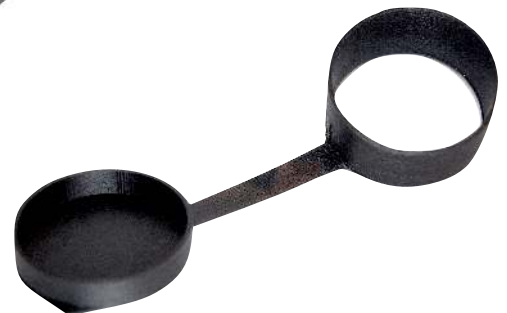
Flip open Flexi Scope Cover - 30mm-58mm **You Choose Size**

Made from the latest TPU-E flexible composite to protect your scope from bumps and dirt. They are also shower proof and stealthy when opened.