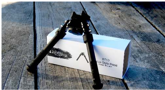
Atlas Style QD Bipods: As a kit with our Sling Stud Picatinny rail adapter or sold separately.